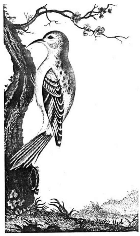
Certhia, or brown creeper.

Under Ann's guidance, the botanic garden grew many varieties of geraniums, camellias, and roses. The Carrs introduced new flower varieties—